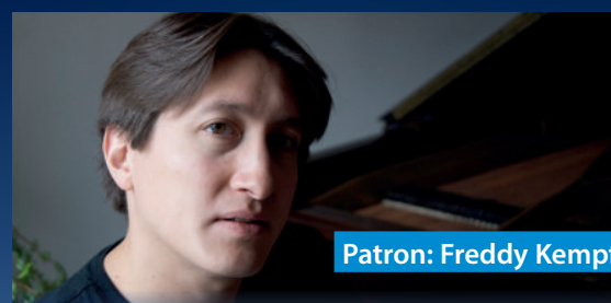
Patron: Freddy Kempf

International concert pianist, recording artist and broadcaster. BBC Young Musician of the Year 1992; Bronze Medallist, Tchaikovsky Piano Competition, Moscow 1998; Classical Brit Award 2001. Recent recitals include the Sydney Opera House, Berlin Konzerthaus, Moscow Conservatoire's Great Hall & Tokyo's Suntory Hall. After Brit Award 2001 add in: He has recently completed a twelve date tour with the Moscow Philharmonic Orchestra for which he received critical acclaim: "Kempf is a pianist in a million ... the incredible definition of Rachmaninov's inner filigree which emerges all the clearer for a refusal to use the sustaining pedal to blur the sound ... his colossal but perfect weight simply stuns" (The Arts Desk). His recent orchestral disc, Prokofiev's Piano Concertos Nos. 2 & 3 with the Bergen Philharmonic Orchestra was nominated for the prestigious Gramophone Concerto award. His most recent CDs featuring Schumann and Tchaikovsky have received critical acclaim.